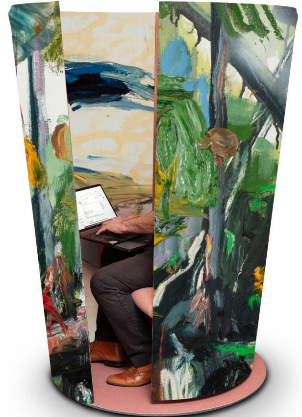
Outside a detail of the painting Wilder (180x140cm, oil on canvas), 2021 by Viljami Heinonen Inside a detail of the painting Fragments (140x160cm, oil on canvas), 2021 by Viljami Heinonen