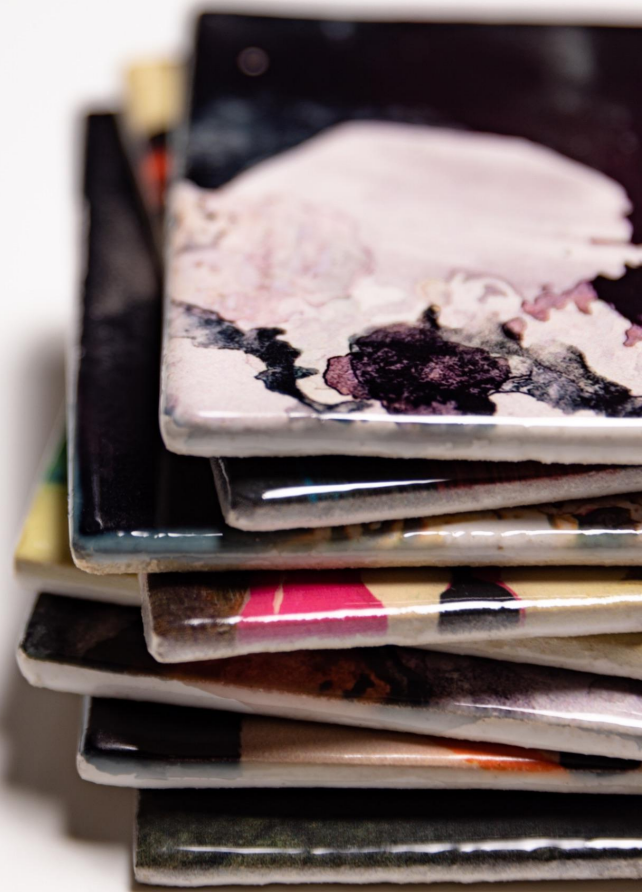
Tile on the top featuring a detail from Kati Immonen's painting.