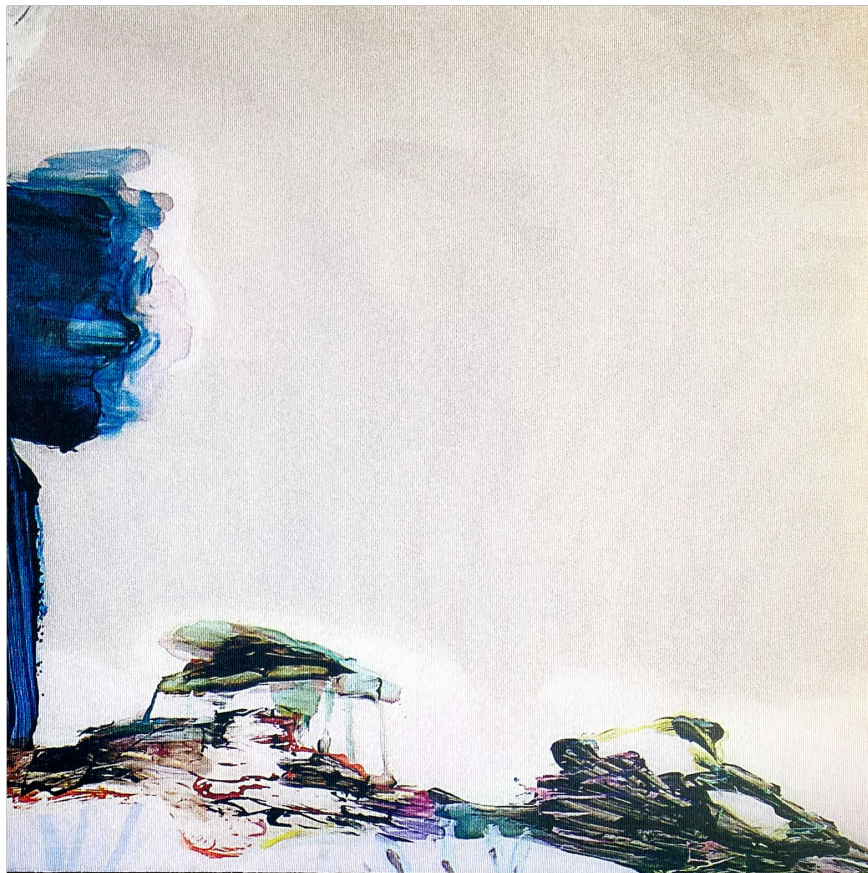
Detail from Elina Ruohonen's painting

Ecophon Super G™ surface is designed for spaces where the panels might be exposed to impacts like restaurants and hotel rooms.